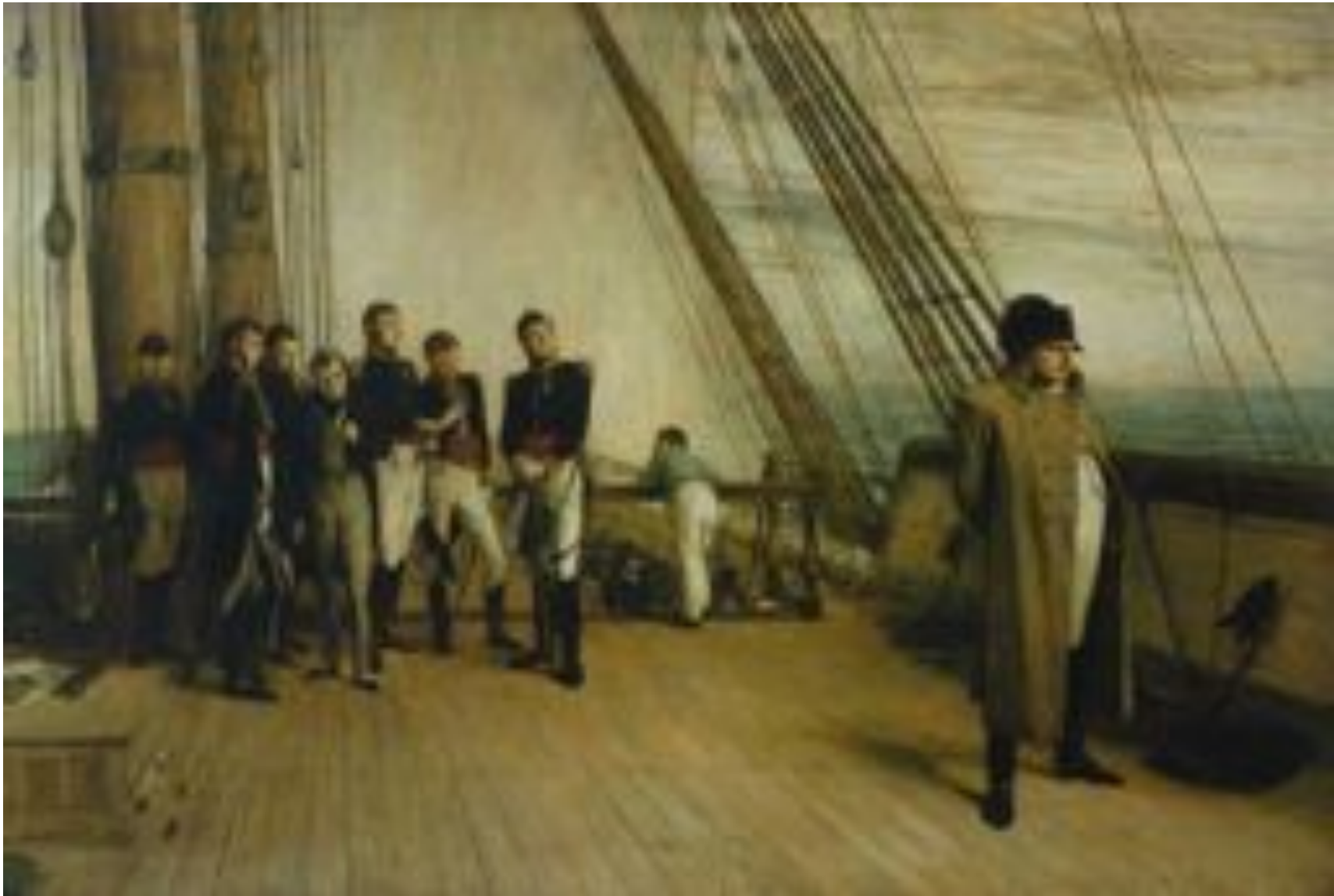
W.Q. Orchardson Napoleon on board the Bellerophon RA 1880 RHA 1885